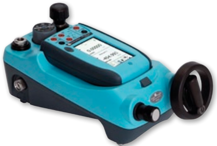
Re-rangeable pressure measurement and generation from 25 mbar (10 inH 2 O) to 1000 bar (15000 psi)